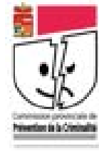
Gouverneur de Liège